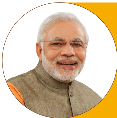
Shri Narendra Modi Prime Minister of India

“ Skilling is building a better India. If we have to move India towards development then Skill Development should be our mission. ”