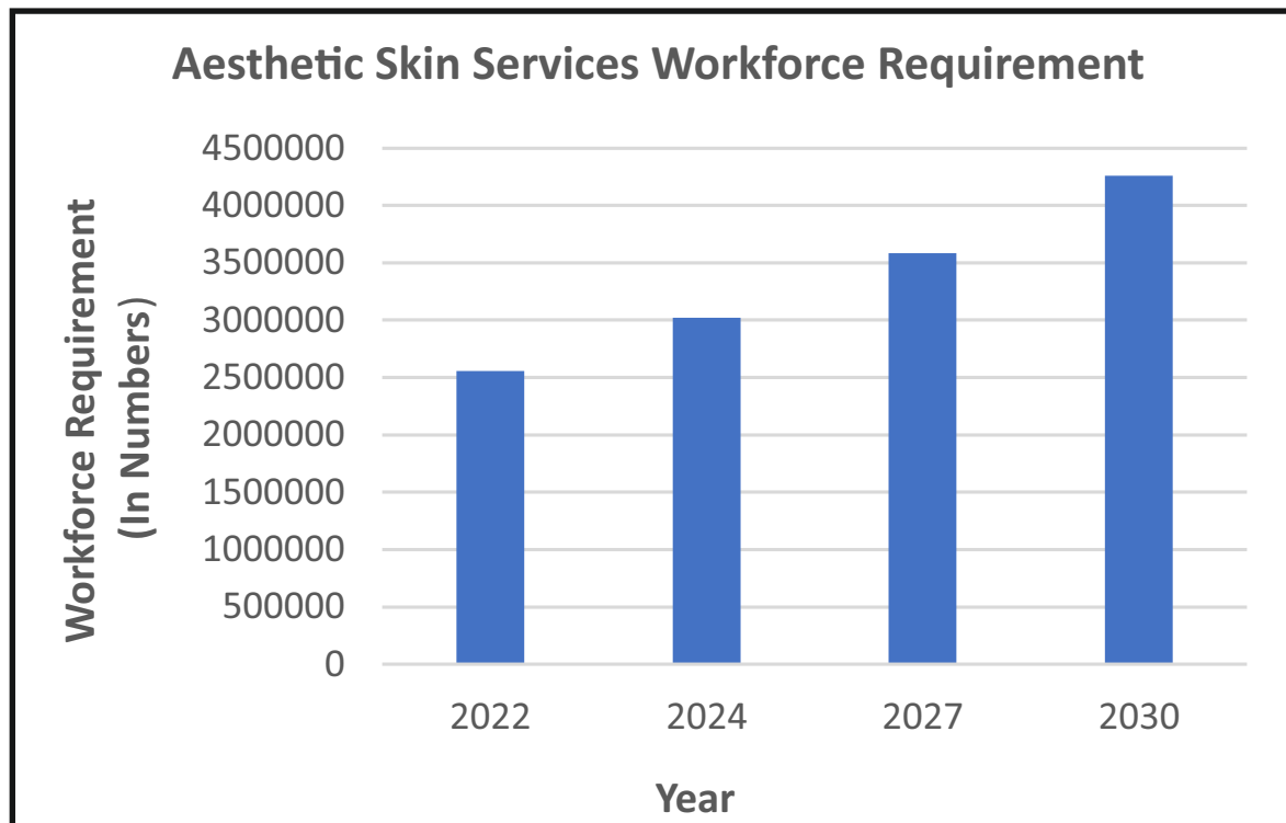
Fig 1.1.1 : Depicting Workforce Requirement in Aesthetic Skin Services Across Years, 2022-2030

Driven by positive macroeconomic factors, and rising aspirations to achieve the perfect body and shape, the demand for aesthetic skin services has grown profoundly over the years. Aesthetic skin services includes both surgical and nonsurgical procedures. The total nonsurgical procedures in 2020 were around 268,536 with most treatments done for hair removal (36.6 percent of total) followed by chemical peels at 16.7 percent. Figure XX Depicts workforce requirement in aesthetic skin services across years, 2022-2030 emphasizing the tremendous scope of opportunities in this field.