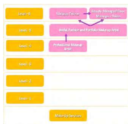
Fig. 1.1.2: Career Opportunities

There are several lucrative career opportunities in this sector as it is diversified in few major segments. Makeup refers to use of subset of cosmetics which are applied both, for enhancing facial features as well as for concealing imperfections of the skin including dark spots, wrinkles, freckles and blemishes. The global makeup market reached a value of US$ 35.5 Billion in 2021 & is expected to reach US$ 45.7 Billion by 2027.