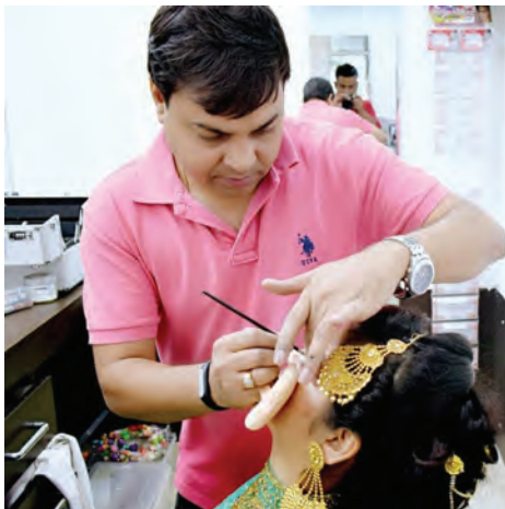
Fig. 1.2.1: An on-going make-up service