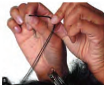
Fig.1.2.3: On-going Elasticity Test

This is to test the internal strength of the hair (the cortex). Hair that has been damaged due to chemical treatments may have lost much of its natural strength. This type of hair may stretch over two-thirds of its original length and may even break off. It is important to carry out this test before perming. Well conditioned hair will stretch and then return to its original length. Take one strand of hair and hold each end firmly between the thumb and forefinger of each hand and gently pull. If the hair stretches more than half of its original length, then it is over elastic and may snap or break during chemical processing.