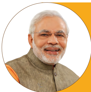
Shri Narendra Modi Prime Minister of India

“ Skilling is building a better India. If we have to move India towards development then Skill Development should be our mission. ”