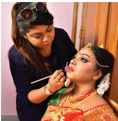
Fig. 1.1.1: A Bridal Make-up Artist during Work

A Bridal Fashion and Portfolio Make-up Artist is an individual who is professionally trained in various make-up techniques, including corrective make-up, airbrush make-up, shading, and highlighting for delivering good quality professional make-up. The make-up artist also does a consultation, advises clients and sells a number of products along with providing necessary skin care and applying make-up for different occasions. The person should also possess adequate knowledge of health, hygiene and safety, beauty and make-up products and therapies.