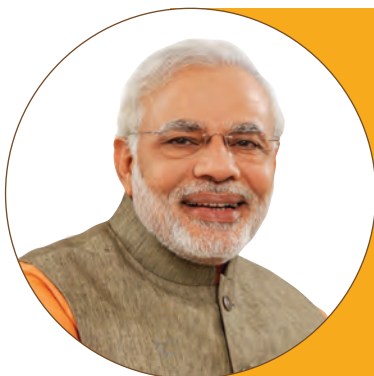
Shri Narendra Modi Prime Minister of India

“ Skilling is building a better India. If we have to move India towards development then Skill Development should be our mission. ”