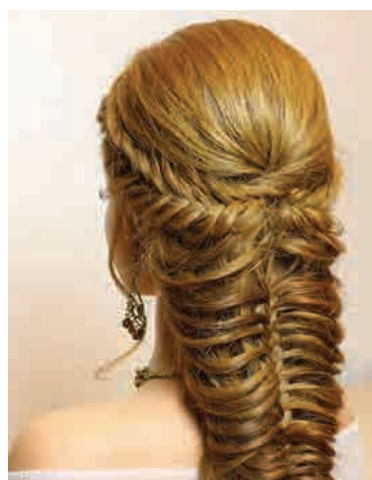
Mermaid Fishtail Braid