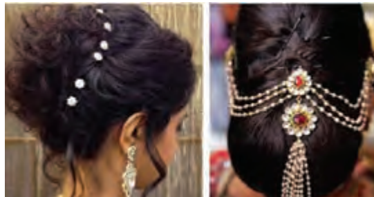
Fig. 1.1.1: Various hairdos

In the past two decades, the average growth of the Global Beauty Market was seen to be 4.5% a year, with annual growth ranging from 3% to 5.5%.