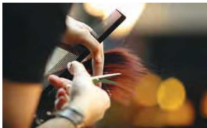
Fig. 1.1.2: Spreading and sizing hair before cutting it

Out of the several employment options, this course will be focusing on the role and responsibilities of a Hair Dresser & Stylist.