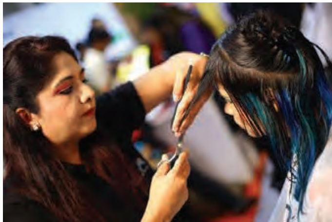
Fig. 1.2.1: Hair Dresser & Stylist cutting a client's hair