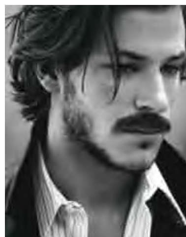
Tousled or Out of the Bed Style