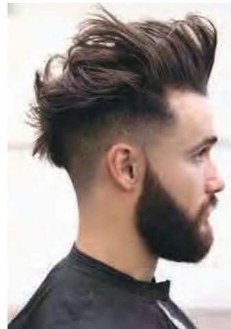
Undercut Mohawk Fade