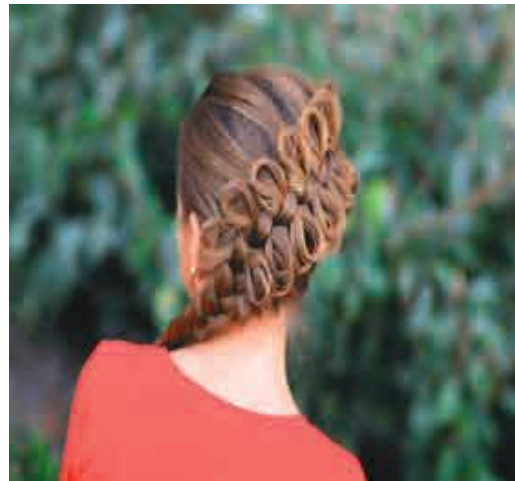
Diagonal Bow Braid