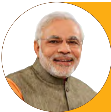
Shri Narendra Modi Prime Minister of India

“ Skilling is building a better India. If we have to move India towards development then Skill Development should be our mission. ”